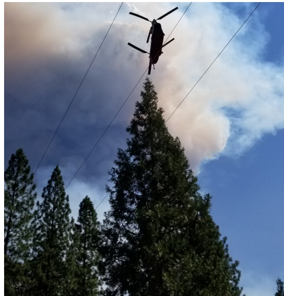
Mosquito Fire September 8, 2022