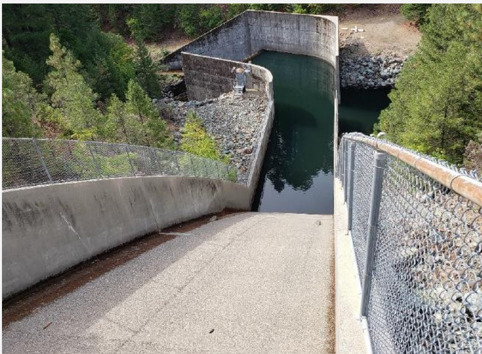
Lower portion of the spillway chute and stilling basin