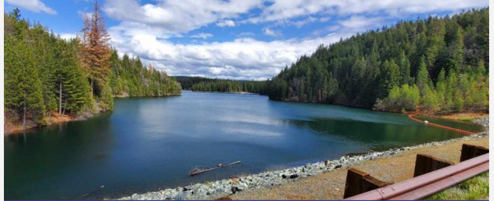
Sugar Pine Reservoir pictured on April 20, 2022

Foresthill Public Utility District's staff has been monitoring the reservoir very closely, adjusting, and making improvements year-round. On April 18th, 2022, Sugar Pine Reservoir filled to capacity and started spilling! Foresthill will continue to provide full water service to all our customers. This is a great sight to see for the summer months ahead! When spilling, the elevation of the reservoir is 3,618.10' = 6,922 acre-feet of water. Sugar Pine Reservoir is ready for all the summer activities we enjoy.